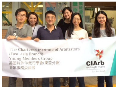
YMG delegates participating in the captioned function