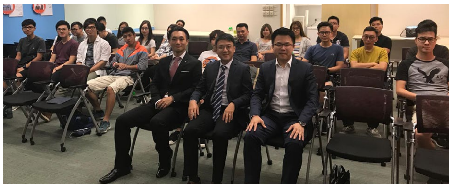
YMG committee members and participants from Hip Hing Construction

On 15 September 2018, the Chartered Institute of Arbitrators (East Asia Branch) (CI Arb(EAB)) Young Members Group (YMG) delivered a talk on alternative dispute resolution at Hip Hing Construction Company Limited. The talk attracted an audience of 40 engineering professionals including quantity surveyors, structural engineers, building services engineers, and safety officers.