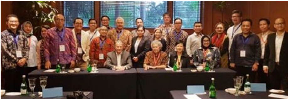
The participants at the Accelerated Route to Fellowship course